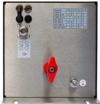
HV-AN 150, view to the EUT port