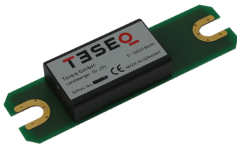
EXT 10uF, option external 10 µF capacitor for RTCA/DO-160G