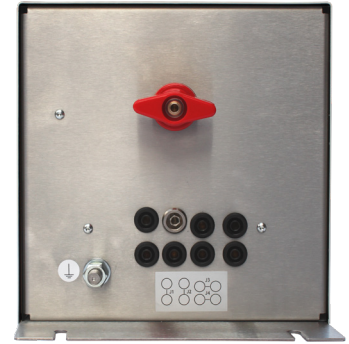
HV-AN 150, view to the AE port

AMETEK CTS Europe GmbH Landsberger Str. 255 · 12623 Berlin · Germany T +49 30 56 59 88 35 F +49 30 56 59 88 34 info.rf.cts@ametek.com www.teseq.com