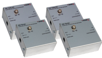
CN T series