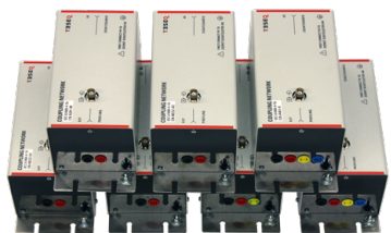
CN M and A series (partly)