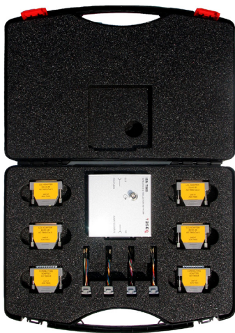
ISN T8 in storage case